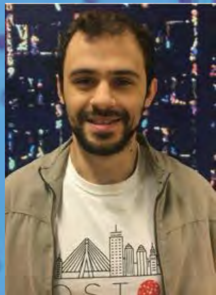
Can Ozden Stratton Lab

Zoom link: https://umass-amherst.zoom.us/j/8850143944